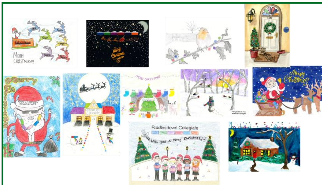
Entries and Winners from Previous Years

How? Entries should be A4 size and include 'Riddlesdown Collegiate' and the College colours as part of the design. Choose materials which will showcase your technical skills. Include your full name, art teacher, tutor and age on the back of your entry.